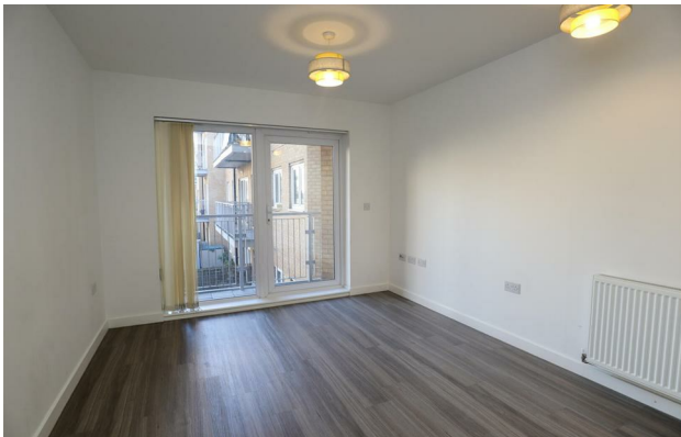
THIRD-FLOOR 437 sq.ft. (40.6 sq.m.) approx.